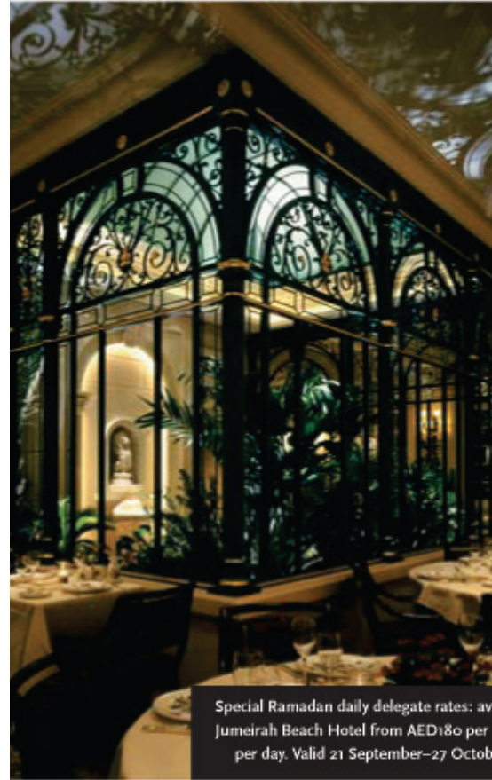
Special Ramadan daily delegate rates: available at Jumeirah Beach Hotel from AED180 per delegate, per day. Valid 21 September-27 October, 2006.